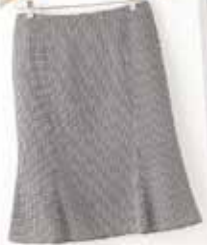
FS25 WENDY SKIRT