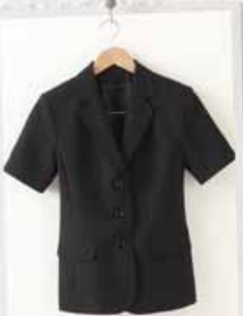
FJ67 GRETA JACKET

You can mix and match these combinations in YOUR CHOICE of colours and styles from our catalogue.