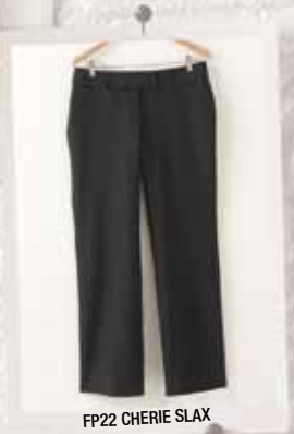
FP22 CHERIE SLAX