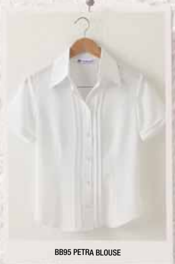
BB95 PETRA BLOUSE