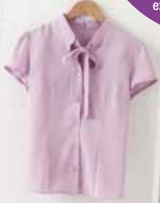
BB93 COLLEEN BLOUSE