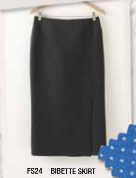
FS24 BIBETTE SKIRT