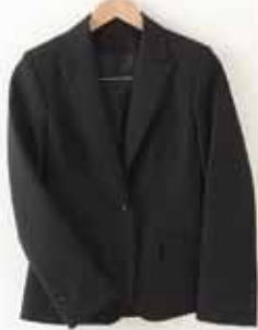
FJ60 NIKKI JACKET