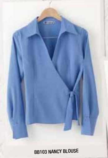
BB103 NANCY BLOUSE

You can mix and match these combinations in YOUR CHOICE of colours and styles from our catalogue.