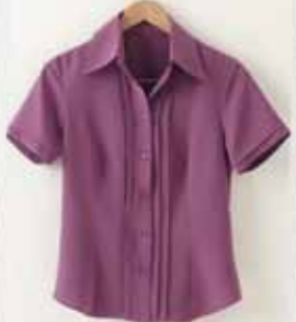
BB95 PETRA BLOUSE