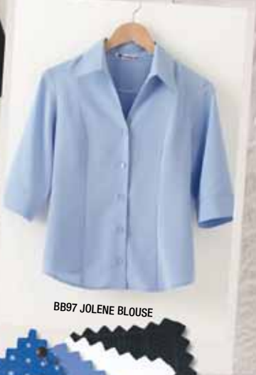
BB97 JOLENE BLOUSE