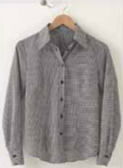
BB98 JANIE BLOUSE