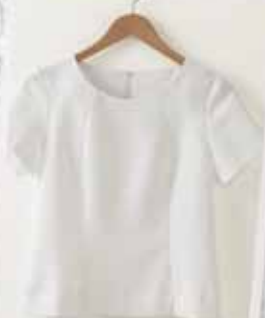
FT21 AVA TOP