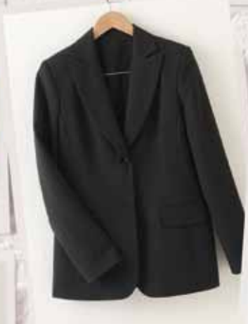
FJ54 ZARAH JACKET