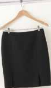
FS27 JUSTINE SKIRT