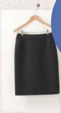
FS22 SHANI SKIRT