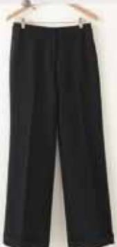
FP23 DEBBY SLAX